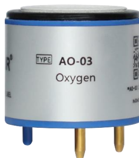
Figure 1. AO-03 Oxygen Sensor

AO-03 oxygen sensor is widely used in the fields of mining, steel manufacturing, petrochemical and air monitoring. For example, it can be integrated into oxygen alarms in mines, air quality detectors and commercial air purification equipment. The data provided in this document are valid at 20°C, 50% RH and 1013 mbar for 3 months after the manufactured date of sensor. Please strictly follow the instructions for operating the oxygen analyzer and replacing the oxygen sensor.